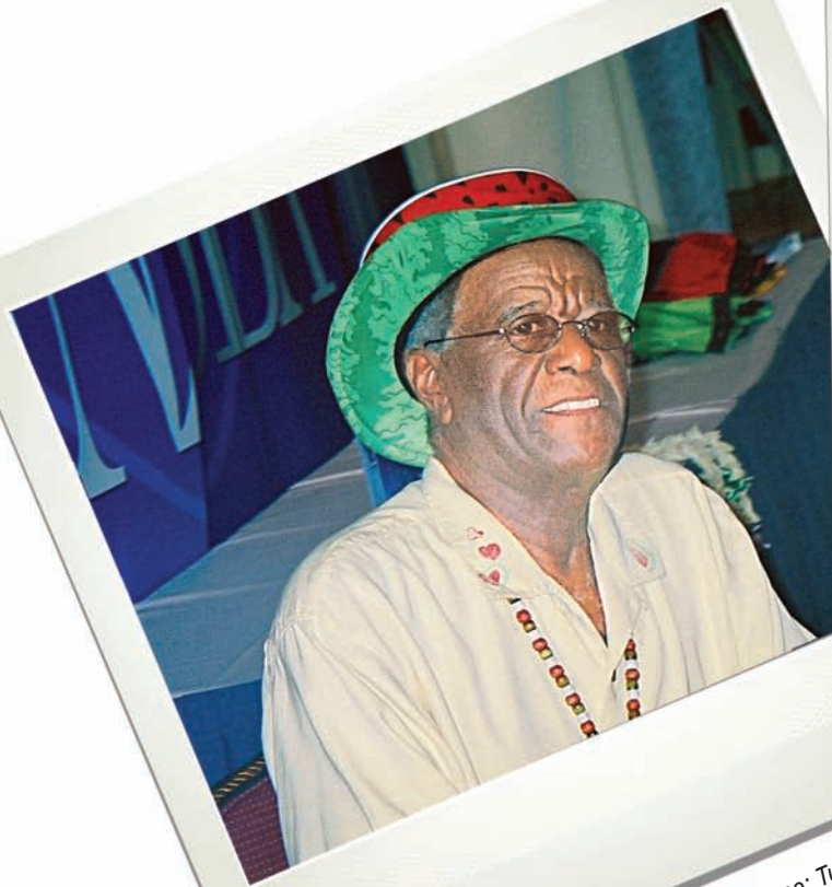
Signing copies of his book, The Man With No Name: Turn Lemons Into Lemonade keeps Wally Amos busy after each speaking engagement. The book tells the story of how Amos, the founder of the [Censored] Cookie Company lost everything, including his name—and turned adversity into opportunity.